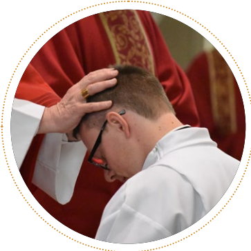
Trained in Compassion.