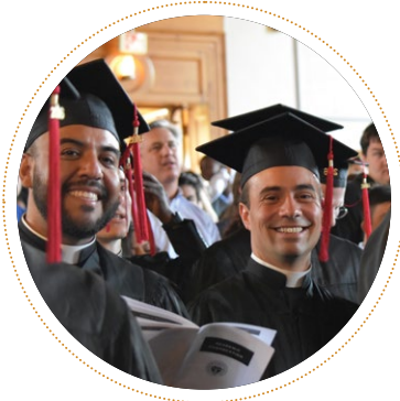
Formed in Tradition.

A seminary functions as the heart of the diocese it serves. It provides a bridge between the individual parishes led by their parish priests and the entire diocesan community led by its bishop.