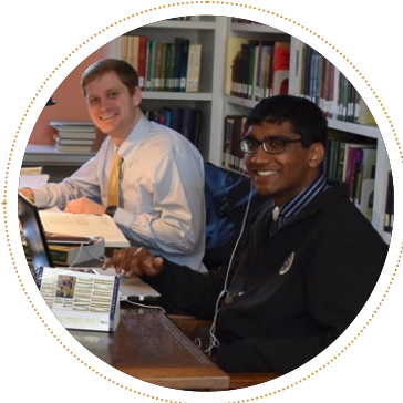
Prepared to Shepherd.